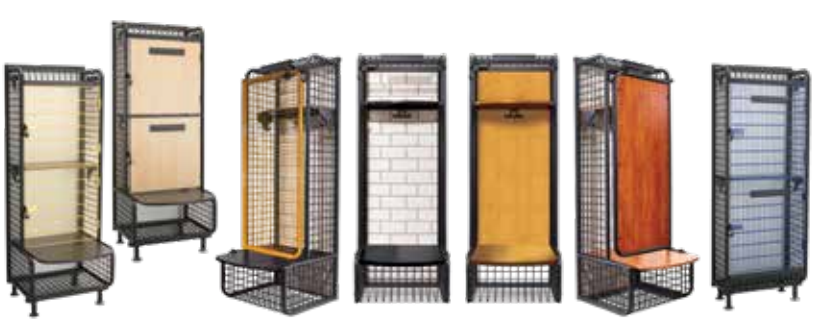
Wood Door, Open, Grille Door and Double Tier Configurations

A space saving locker design that keeps your gear more sanitary. Designed with integrated benches, AirPro lockers free up valuable real estate, creating extra floor space and a more open feel. Plus, AirPro's durable metal grid construction allows for maximum airflow and minimum hassle. They're easy to clean and laminated surfaces are more sanitary with treated antimicrobial nano-silver technology that will last the life of the product. With new AirPro lockers, your team room problems are solved.